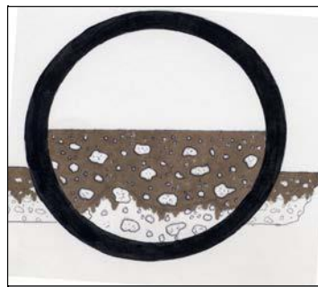
Treated with Ultra