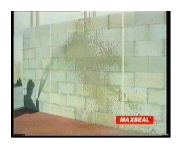
Wet surface before application.

If Efflorescence present, consult Office prior to waterproofing.