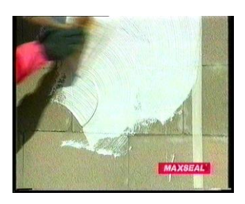
Apply by brush ...