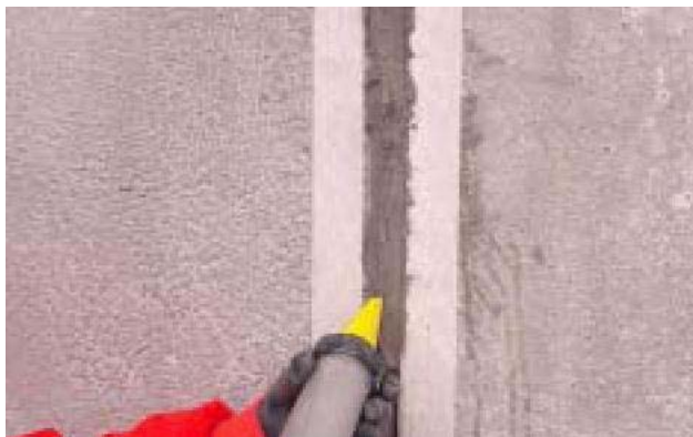
Application of MAXJOINT ELASTIC

Component A: NON toxic, NON flammable. It is not classified as dangerous material for transportation.