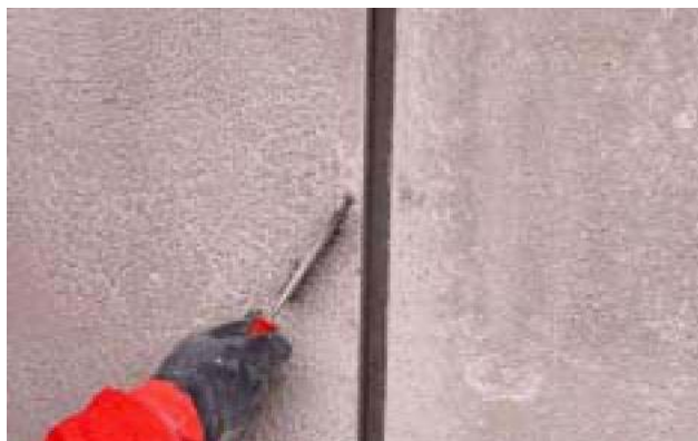
Preparation and cleaning of joint