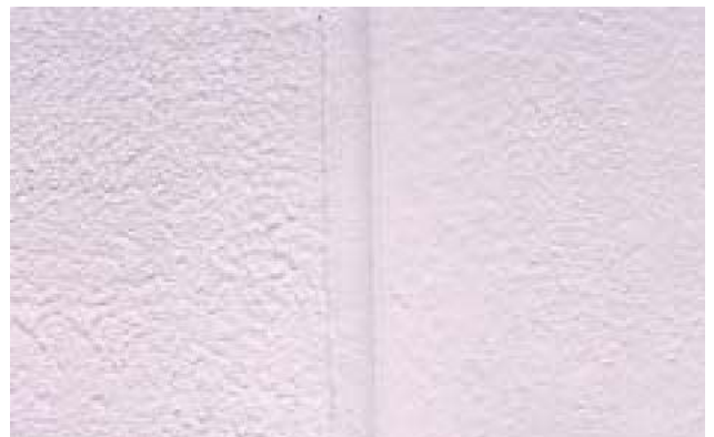
View of the finished joint. It can be painted with the desired colour

For any other issues, consult our Technical Department.